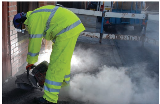
Figure 1 Common tasks like cutting can create very high dust levels

However, most of these diseases take a long time to develop. Dust can build up in the lungs and harm them gradually over time. The effects are often not immediately obvious. Unfortunately, by the time it is noticed the total damage done may already be serious and life changing. It may mean permanent disability and early death.